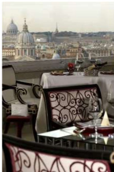
The view from Imàgo restaurant in Rome, Italy

The hotel, which sits atop the Eternal City's Spanish Steps has played host to royalty, celebrities, politicians, artists, musicians, thought-leaders and discerning travellers. Over the years, its famous guests have included the Kennedys , the Beckhams , Prince Charles and Princess Diana , Prince Rainier of Monaco and Grace Kelly , Audrey Hepburn , Steve Jobs , Nicole Kidman , Karl Lagerfeld , Anna Wintour , and Tom Cruise and Katie Holmes (who stayed there ahead of their wedding at Odescalchi Castle in Bracciano, an hour outside Rome, in 2006).