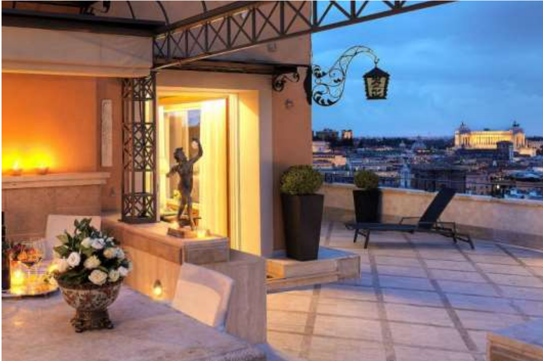
A balcony at the Hassler hotel in Rome, Italy