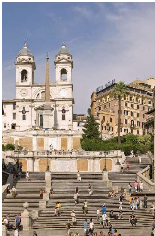
Hotel Hassler in Rome, Italy, overlooks the Spanish Steps