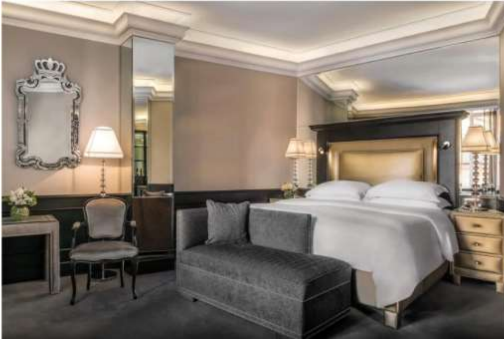
A suite at the Hassler hotel in Rome, Italy