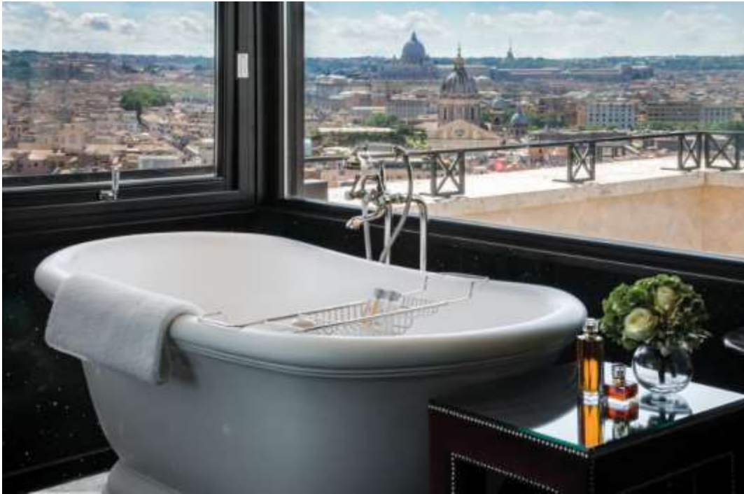
A bathtub with a view at the Hassler hotel in Rome, Italy

What's more, the hotel's Amorvero Spa has a sauna, steam room, gym with cardio machines and weights (a personal trainer can be booked upon request), and treatment rooms for massages. To top it all off, famed hairdresser Rossano Ferretti's Rome salon is inside the hotel, while master perfumer Lorenzo Dante Ferro, a famous Italian "nose", created an exclusive fragrance for the hotel, Amorvero Perfume, with notes of jasmine, tuberose and damask rose alongside bergamot, lemon, mandarin, sandalwood, amber and vanilla.