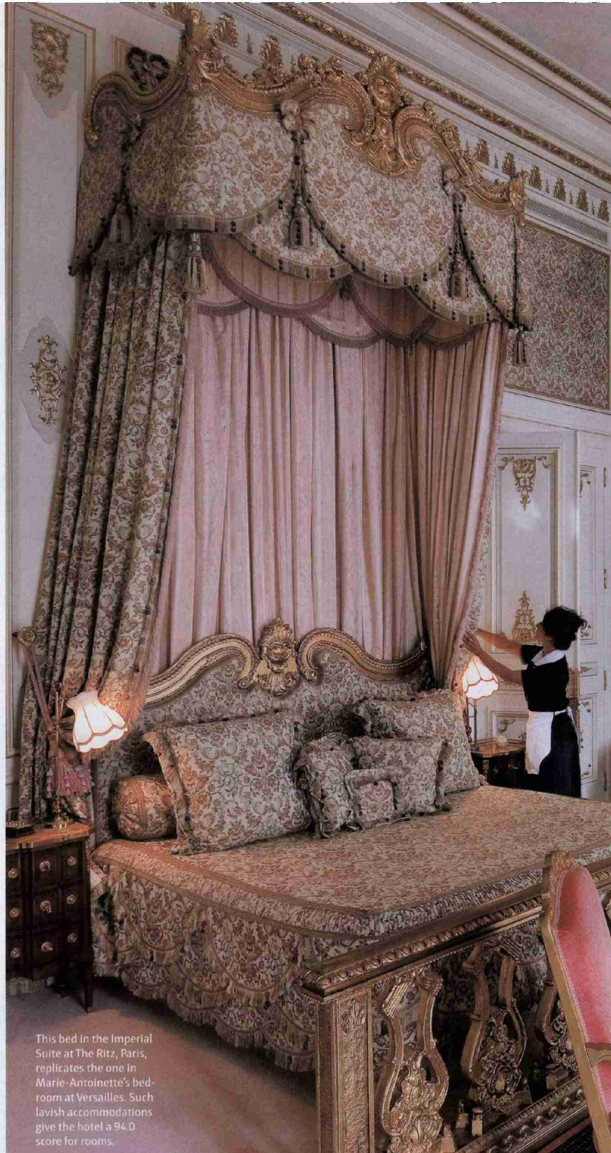
This bed in the Imperial Suite at The Ritz, Paris, replicates the one in Marie-Antoinette's bedroom at Versailles. Such lavish accommodations give the hotel a 94.0 score for rooms.

Villa San Michele, Fiesole 94.9 Ⓜ93.6 Ⓜ100 Ⓜ97.9 Ⓜ87.2 Ⓜ95.7