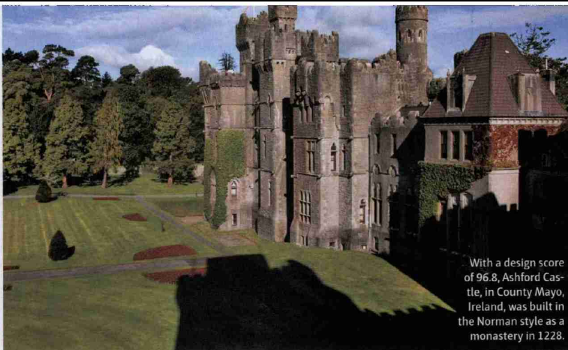
With a design score of 96.8, Ashford Castle, in County Mayo, Ireland, was built in the Norman style as a monastery in 1228.